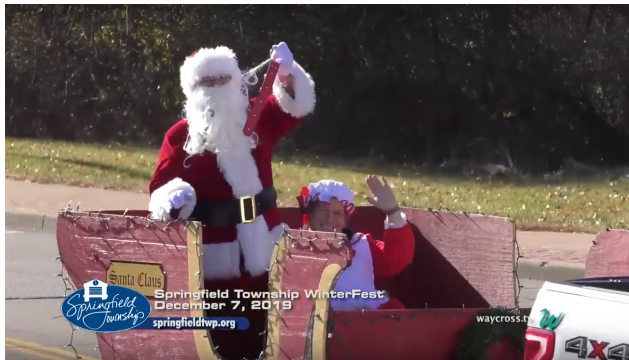
Springfield Township Winterfest

Waycross cablecasts the council and trustees meetings from our four communities LIVE, then replays them throughout the month. Waycross cablecast the general council/trustee meetings held in 2019 for our communities. In addition, Waycross videotaped for playback public hearings and zoning meetings, Winton Woods and Northwest School Board meetings, as well as the Hamilton County Public Library Board of Trustees meetings.