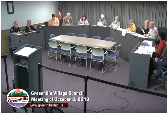
Greenhills Village Council Meeting

The Waycross Government Access Channel is operated on behalf of the governments of Forest Park, Greenhills, Springfield Township and Colerain Township. Our mission - To encourage the active participation of residents in the democratic process - is achieved through the effective use of communication tools, providing our governmental bodies with the necessary resources to educate and inform residents on the various activities and issues – local, state and federal - that ultimately impact their quality of life.