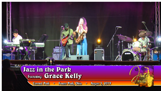
Forest Park - Jazz in the Park Concert

Waycross produced 229 new government access programs, totaling 260 hours. In addition to meetings, programs included Columbus Report, Election Forums, Talking with..., County Fare, Concert on the Commons, Forest Park Chamber of Commerce Meetings, Jazz in the Park, Forest Park Environmental programming, Colerain Twp. Concerts and many more.